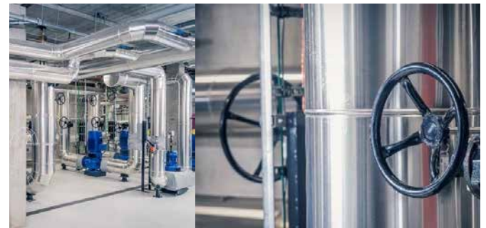
BROEN Ballomax® ball valves controlling the flow of district heating water

For the town of Aabybro BROEN has supplied valves for installation both above and below ground, isolated flexible main stop valves for house inlets as well as well-valves - combining two valves in one well.