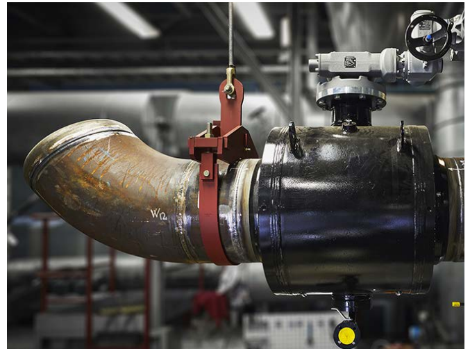
BROEN Ballomax® DN50 – Double bearing valve ball with Double Block and Bleed – DBB – outlet under the valve body

The new valves welded into the station have a special job to do and are so-called Trunnion valves – i.e. double bearing valves which means that the ball is anchored both at the top and at the bottom. This reduces friction and torque considerably, when the valve is activated. Valves fitted with a relief valve - popularly called a “tell-tale valve” - ensure, that the chamber between the ball and the body can be completely emptied, so that it is possible to ascertain, if the valve closes 100% tightly – hence the name Double Block and Bleed.