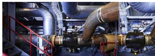
BROEN Ballomax® DN50 – Double bearing valve ball with Double Block and Bleed – DBB – outlet under the valve body

Two BROEN Ballomax® valves function as main shut-off valves between the new biomass plant and the combined heat and power station. Two other BROEN Ballomax® valves with AUMA gear function as bypass valves, that can direct the supply pipe water from the biomass plant into the steam boiler for further heating, if the temperature is not sufficiently high, before it is circulated to the users. With a maximum flow capacity of 2,400m 3 /h, temperatures of up to 120°C and a pressure of up to 25 bar, it is important that the valves function correctly.