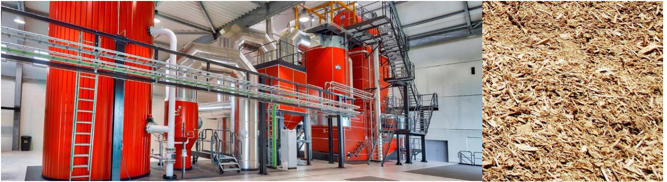
Main boiler – Kathrine and close-up of wooden chips

says: “Many customers ask for fully welded ball valves for shut off applications instead of butterfly valves, because the ball valves are more reliable. Over the years Weiss has built up a good experience using BROENs ball valves for district heating plants and it is a brand that customers trust – the valves are long lasting and operate with no problems. BROEN Ballomax® still proves itself among the most efficient and reliable district heating valves on the market today”.