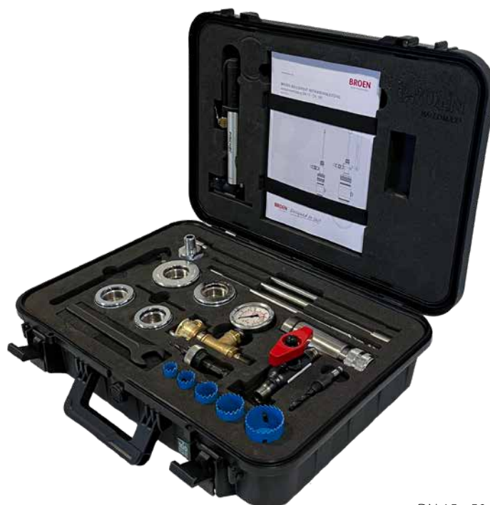
DN 15 - 50

The basis case 68 501 015 000 and the extension case 68 503 065 000 can be used with the previous delivered and also the new optimized BALLOMAX® hot tapping valves with reduced bore.