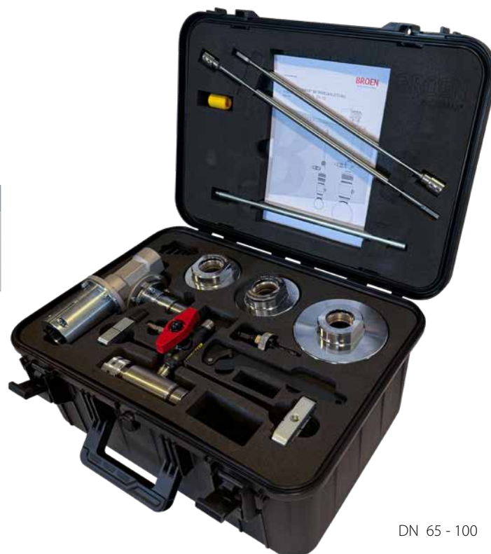
DN 65 - 100

For the new optimized BALLOMAX® hot tapping valves DN 65 to DN 100 full bore there will be an updated toolset / expansion set. With this toolset / expansion set the BALLOMAX® hot tapping valves in the range DN 65 to DN 100 reduced and full bore can be used.